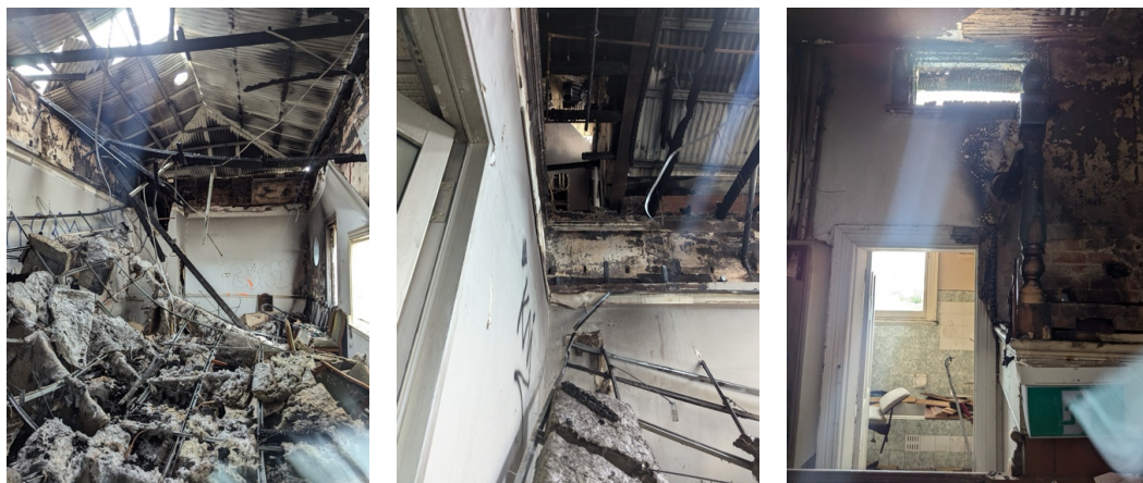
Figure 3 - Photographs of damage. 1. Annex, 2. Annex ceiling, 3. Upper level rear wall